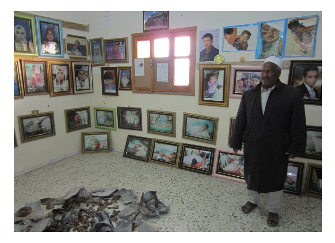
Survivor of NATO airstrikes in Majer on 8 August 2011, which killed 34 civilians

On 19 March 2011 several member states of the North Atlantic Treaty Organization (NATO), including the USA, the UK and France, launched a military campaign with air and naval strikes against Colonel Mu'ammar al-Gaddafi's forces. The strikes were launched pursuant to UN Security Council (UNSC) resolution 1973 (2011) of 17 March 2011, which authorized member states "to take all necessary measures (...) to protect civilians and civilian populated areas under threat of attack in the Libyan Arab Jamahiriya" and introduced a "no fly zone" above Libya. The National Transitional Council (NTC), the emerging new authority which by then controlled eastern Libya, had called for and fully supported the imposition of a no-fly-zone and international military action against al-Gaddafi's forces.