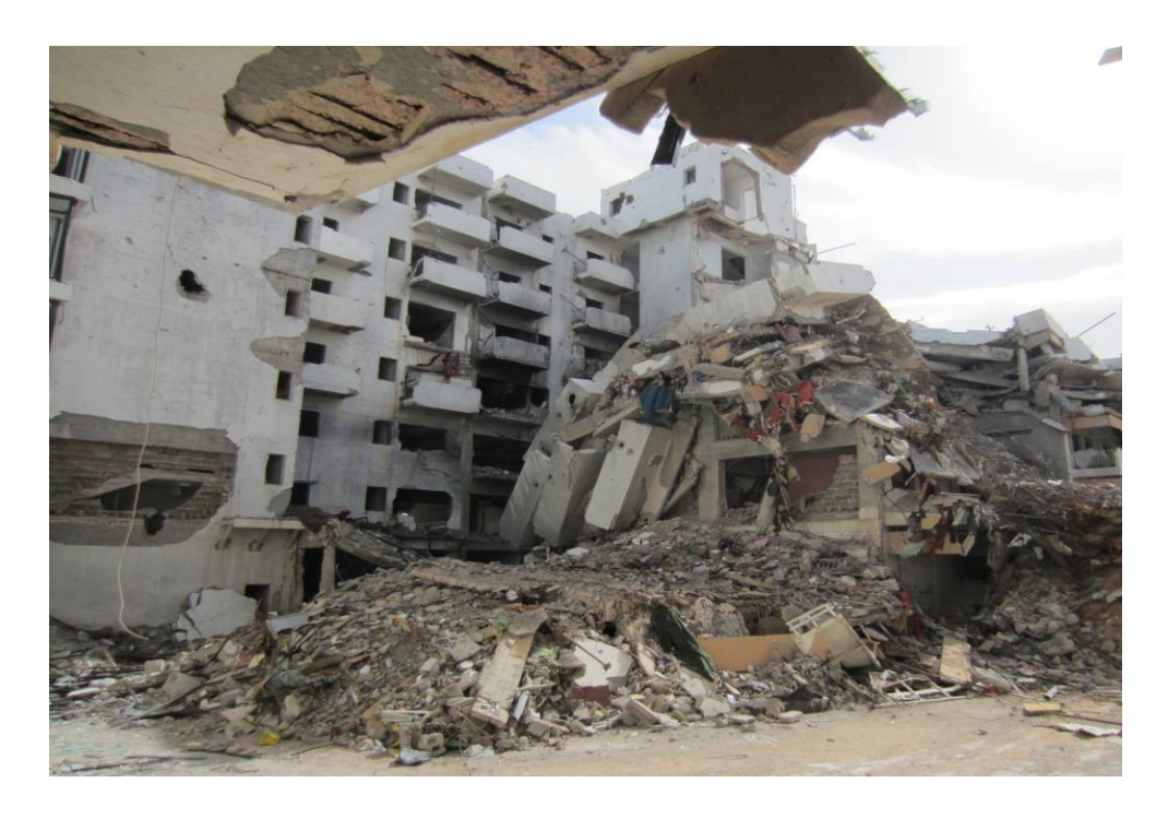
Apartment building struck on 16 September in Sirte

whose family lived in an apartment on the third floor, was killed in the strikes. His father, 'Omar Mohammed Suleiman, told Amnesty International that it is not clear whether other residents were killed in the strike, as it has not been possible to establish how many residents were in the building at the time of the strikes. Many residents had fled the building in the days prior to the strike and the others, as well as many of the city's inhabitants, fled after the attack (the city remained under siege until the capture and killing of Colonel al-Gaddafi in the town's outskirts on 20 October 2011). Most residents had still not returned by February 2012, when Amnesty International visited the area. The bodies of the two victims were only recovered in mid-January 2012.