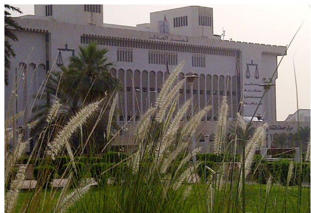
The Palace of Justice, Kuwait City, which houses Kuwait's highest courts

This chapter features some of the most serious of these cases that Amnesty International has documented.