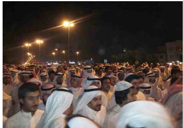
A demonstration outside Kuwait Central Prison, calling for the release of opposition politician Musallam Al-Barrak, Kuwait, 31 October 2012.

The government has used existing laws and adopted new ones to target its critics, including human rights defenders and political opponents, and ultimately close down space for dissent. Judicial authorities have ordered the suspension or closure of newspapers and other media platforms. The government has invoked the country’s nationality law to strip some of its critics of their citizenship, sending a stark warning to others of the consequences of speaking out. Members of Kuwait’s Bidun community, who are denied Kuwaiti nationality, have been among those arrested and imprisoned for peacefully exercising their right to freedom of expression.