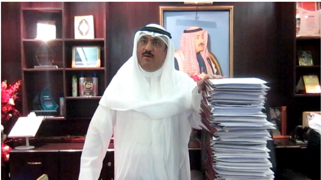
Musallam al-Barrak with documents related to the many legal cases against him, at his office in al-Andalus, Kuwait City, April 2014

Amnesty International considers Musallam al-Barrak a prisoner of conscience, imprisoned solely for the peaceful exercise of his right to freedom of expression.