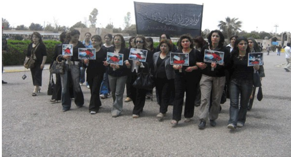
Women demonstrating against an honour killing in front of the Kurdistan Parliament, Erbil 2007.