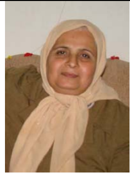
Akhtar Ahmad Mostafa © Private