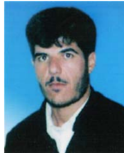
Gharib 'Aziz Mahmoud