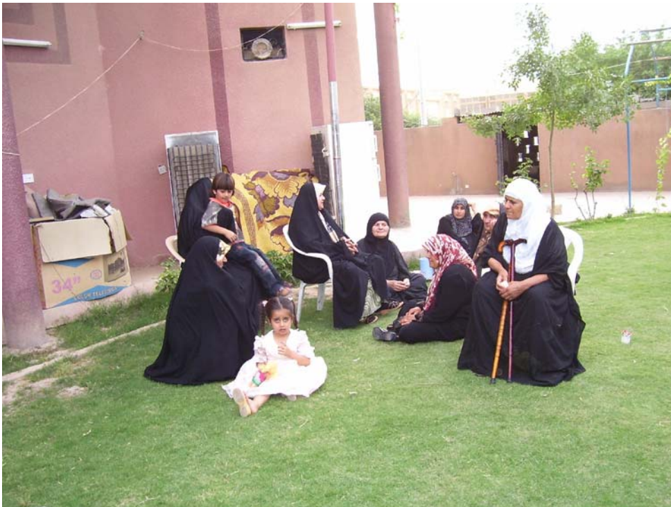
Mothers and relatives of detainees wait to be interviewed by Amnesty International May/June 2008

All Islamist detainees who have been released following amnesties, including amnesties issued by the President of the KRG, have been required, as a condition of their release, to report to the Asayish on a weekly basis and are not allowed to travel outside the governorate in which they reside without permission from the Asayish . If the released person fails to honour these conditions or commits a criminal offence, the Asayish can redetain him and confiscate his house or the house of a guarantor that he has nominated.