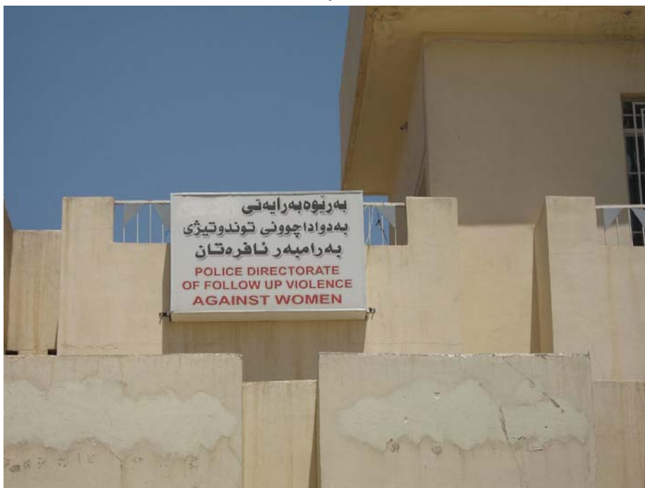
Police Directorate to Combat Violence Against Women, Erbil

One woman interviewed by Amnesty International delegates in May 2008 stated that she had suffered decades of violence and abuse by her former husband, to whom she had been