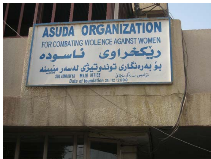
The NGO ASUDA runs a shelter in Sulaimaniya

A women caseworker at a shelter in the Kurdistan Region told Amnesty International: "I have received threats from the day I have started working here several years ago." She reported one incident in 2008 when a relative of a woman staying at the shelter threatened her by phone saying: "I want to tell you that I know you and your family name. I know that you gave the names of the men suspected of having attacked her to the police and you also wrote the letter to the court. You defend her but that is wrong. I warn you!" After the call the caseworker informed the police and as a safety measure left her workplace and took her child out of the kindergarten for that day. The caller was never identified.