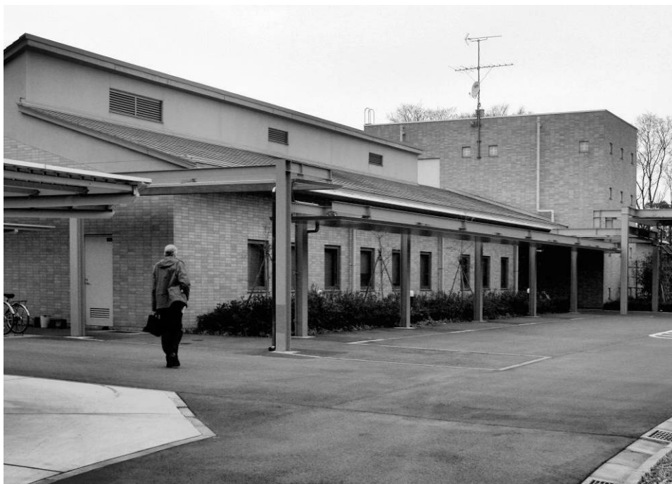
Tokyo Forensic Unit is one of more than 30 such units throughout the country established to allow for the evaluation of the mental health of detainees. The majority of residents in the Tokyo Forensic Unit are diagnosed with schizophrenia.

The policy also affects families of death row prisoners who are not told of the execution until after it has occurred. In one case, a mother arrived at the prison to visit her son to be told to come back later. When she did, she was told that he had been executed. 101 Again the rationale for this cruel policy is explained in benevolent terms for both family and prisoner: