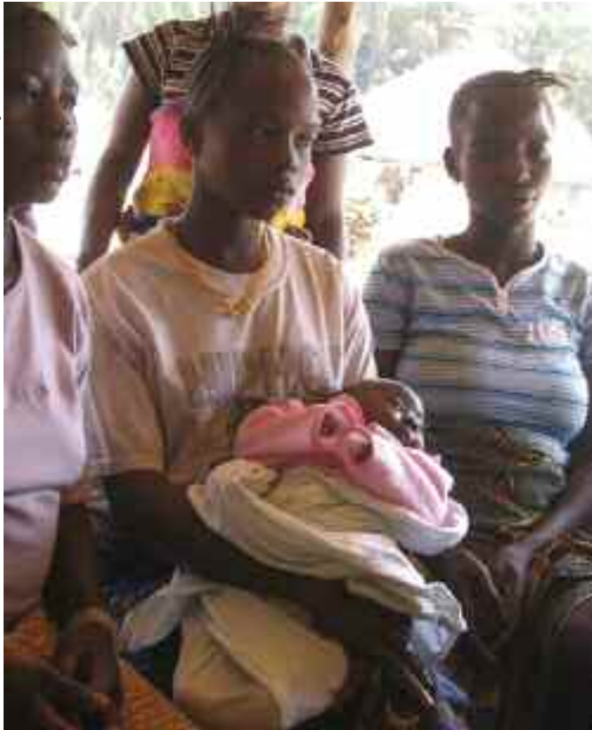
Pregnant women and girls, some as young as 16, in a village in Koinadugu district, northern Sierra Leone, February 2009.

In an effort to address discrimination against women and early marriage, in 2007 three gender laws were passed: the Domestic Violence Act, the Devolution of Estates Act, and the Registration of Customary Marriage and Divorce Act. 30 However, a government body 31 set up to assist in their implementation has found that there is very little understanding within communities of the details of these laws, and they have largely not been implemented. For example, while customary marriages and divorces are supposed to be registered, in reality the process for doing this has not been set up.