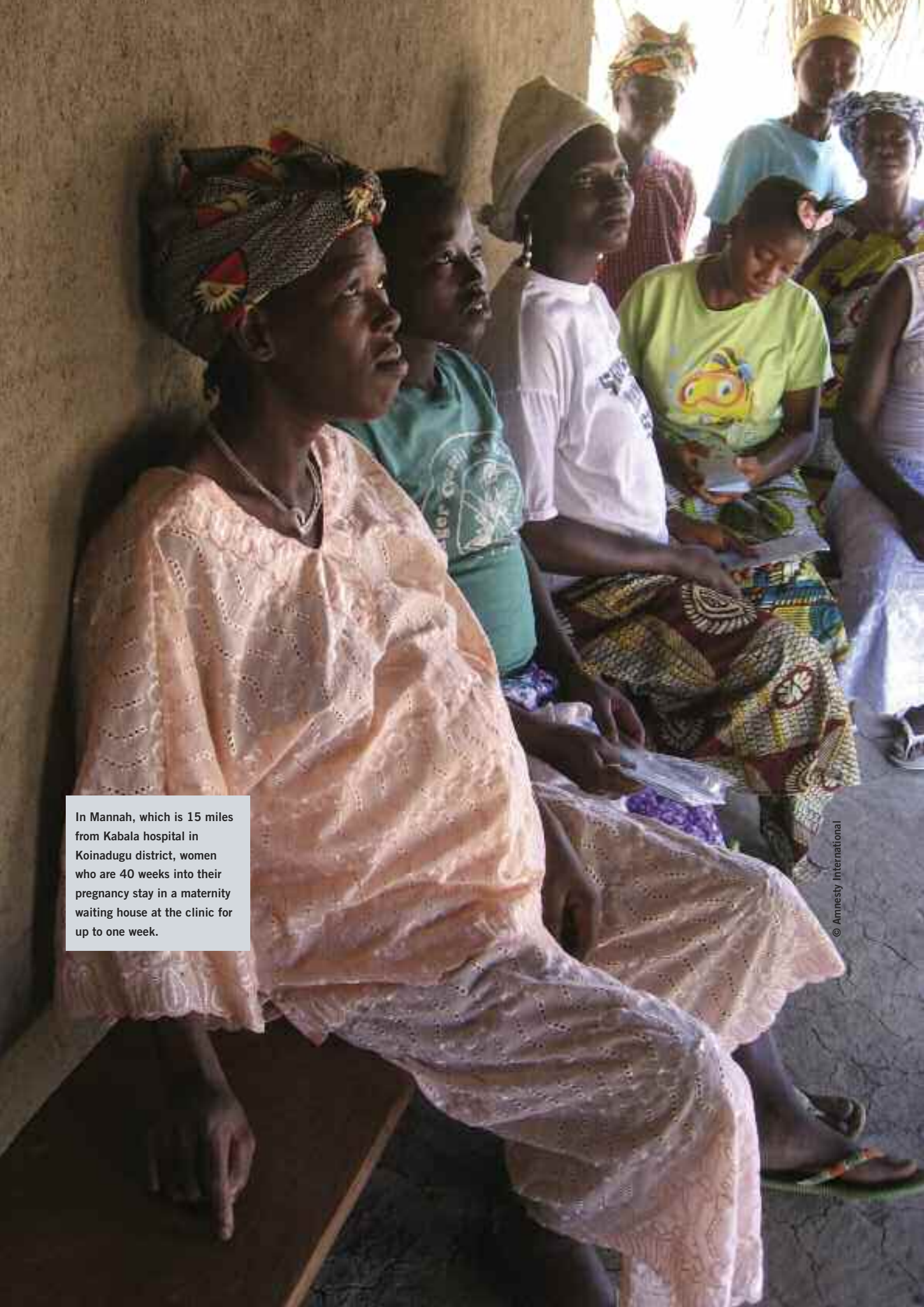
In Mannah, which is 15 miles from Kabala hospital in Koinadugu district, women who are 40 weeks into their pregnancy stay in a maternity waiting house at the clinic for up to one week.