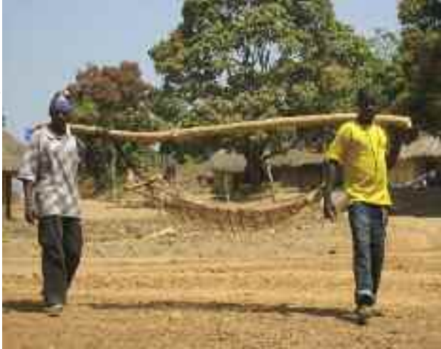
Above: Volunteers who carry women in labour, and others needing transport, to the nearest health facility in a hammock, Koinadugu, February 2009.