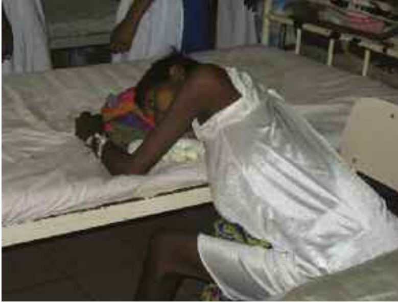
A woman who has given birth to twins and needs a blood transfusion, Princess Christian Maternity Hospital, Freetown, February 2009. The hospital has no blood bank.

all, leaving hundreds of thousands of women without access to life-saving treatment.