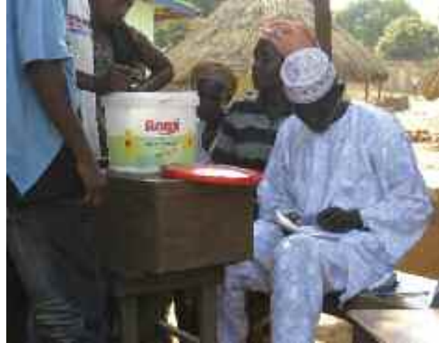
Right: Villagers contributing to the savings and loan scheme in Dogoloya, Koinadugu, February 2009.

Since that meeting, the Minister of Health has been replaced and as of July 2009 the health financing system was still under review. In August 2009 the Ministry of Health announced plans for providing free care for pregnant women and children, established an advisory committee of international NGOs and donor agencies, and put an implementation plan together which was submitted to donors for funding in August.