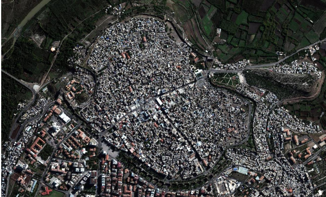
↑ Satellite imagery shows Sur on 8 November 2015 before the major curfew put into effect on 11 December 2015.

briefing paper. The authorities also granted limited access to the area of Sur under curfew in May and June 2016. In June, despite the curfew there having been lifted, Amnesty International delegates were prevented from entering Cizre, on the spurious grounds that written permission was required to enter the city. Amnesty International delegates were due to conduct interviews with returning families in Cizre and families displaced from Şırnak and living in surrounding villages. Amnesty International requested to meet with the Nusaybin District Governor in October but this request was rejected. Amnesty International presented its main findings and requested additional information in a letter to the Minister of the Interior on 28 November.