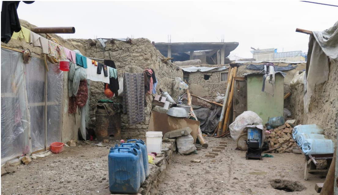
Chaman-e-Babrak settlement, Kabul, November 2015

Past attempts to allocate government land to displaced people or returnees in Afghanistan, as stipulated in Presidential Decree 104 (December 2005), have been largely ineffective and riddled with corruption. 131 The land has often been barren or unfit for agriculture and too far away from services and employment opportunities. 132