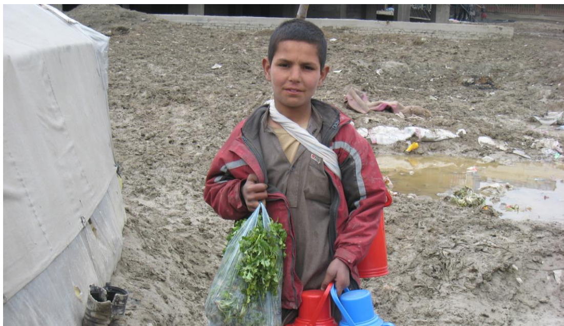
A 14-year-old boy in Charrahi Qambar settlement in Kabul, November 2015

Additionally, public hospitals only provide vaccinations and contraceptives free of charge, while other medicines must be bought from private clinics or pharmacies. While affording medicines is a struggle for many Afghans, it can be particularly difficult for displaced people who lack regular incomes and are often economically worse off than other urban poor (see more in section 4.5: Employment). Some displaced people reported having debts of several thousand Afs at private hospitals or pharmacies to buy medicines which they could not afford to pay back. One 55-year-old man in Naderabad camp in Mazar-e-Sharif said: