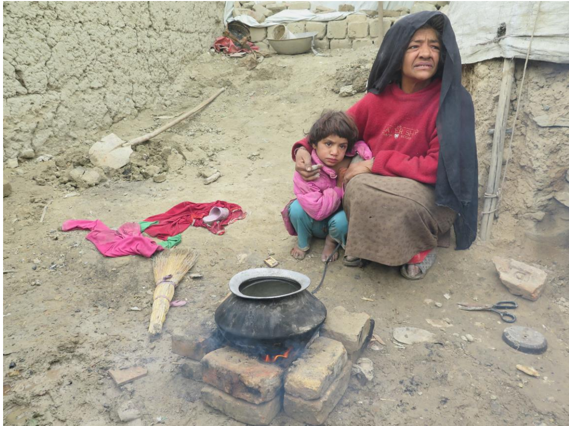
A displaced woman with her daughter in Kabul, November 2015